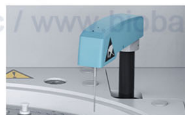
Mixer Probe Teflon coating to avoid cross contamination.