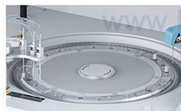
Reaction Tray 37±0.2°C, real-time monitor.