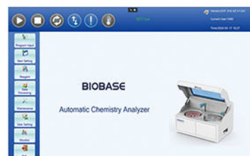
Software User-friendly software.