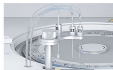
Washing Probe Independent 3-step washing system.